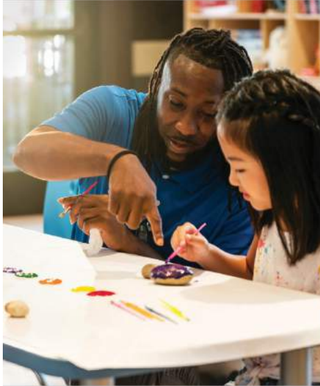
Clockwise from top left: Leaping off the dock at the Ritz-Carlton Reynolds, Lake Oconee, in Georgia; a glamping tent at Terramor Outdoor Resort, in Maine; rock painting at the Ritz-Carlton; tubing on the Guadalupe River at Camp Fimfo, in Texas.