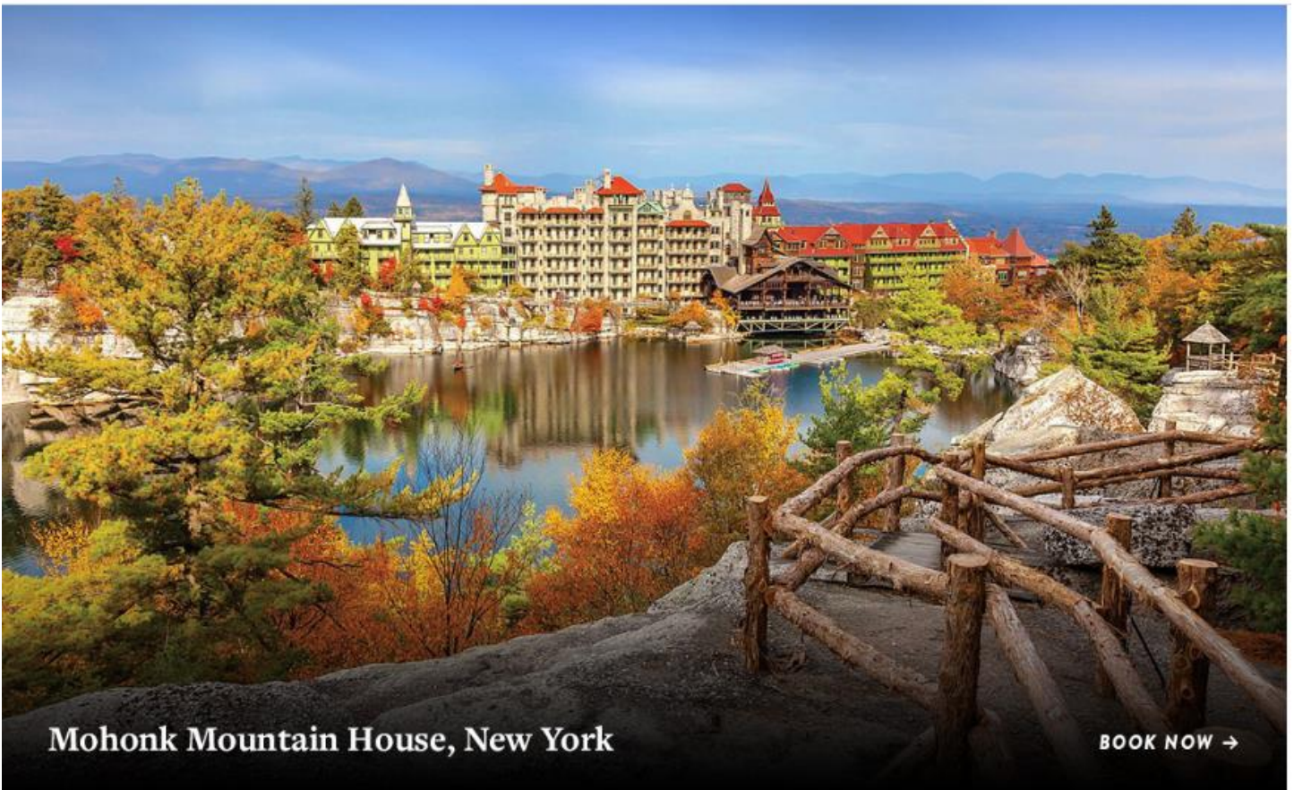
Mohonk Mountain House, New York

For a mountainy retreat the whole family will love, there's magical Mohonk Mountain House, a Victorian castle-turned-resort on a private glacial lake in the Hudson Valley. It sounds like a fairytale, and parents might just feel it is considering they can drop off children 5-12 at the Kids Club where they'll go on boat rides, scavenger hunts, try rock scrambling, and participate in sports tournaments. There's even the Junior Naturalist Program (for ages 5-13) that includes fossil hunts, plant identification walks, and arts projects. For adults, there's farm-to-table cuisine, an award-winning spa, and more active pursuits such as standup paddleboarding and fishing.