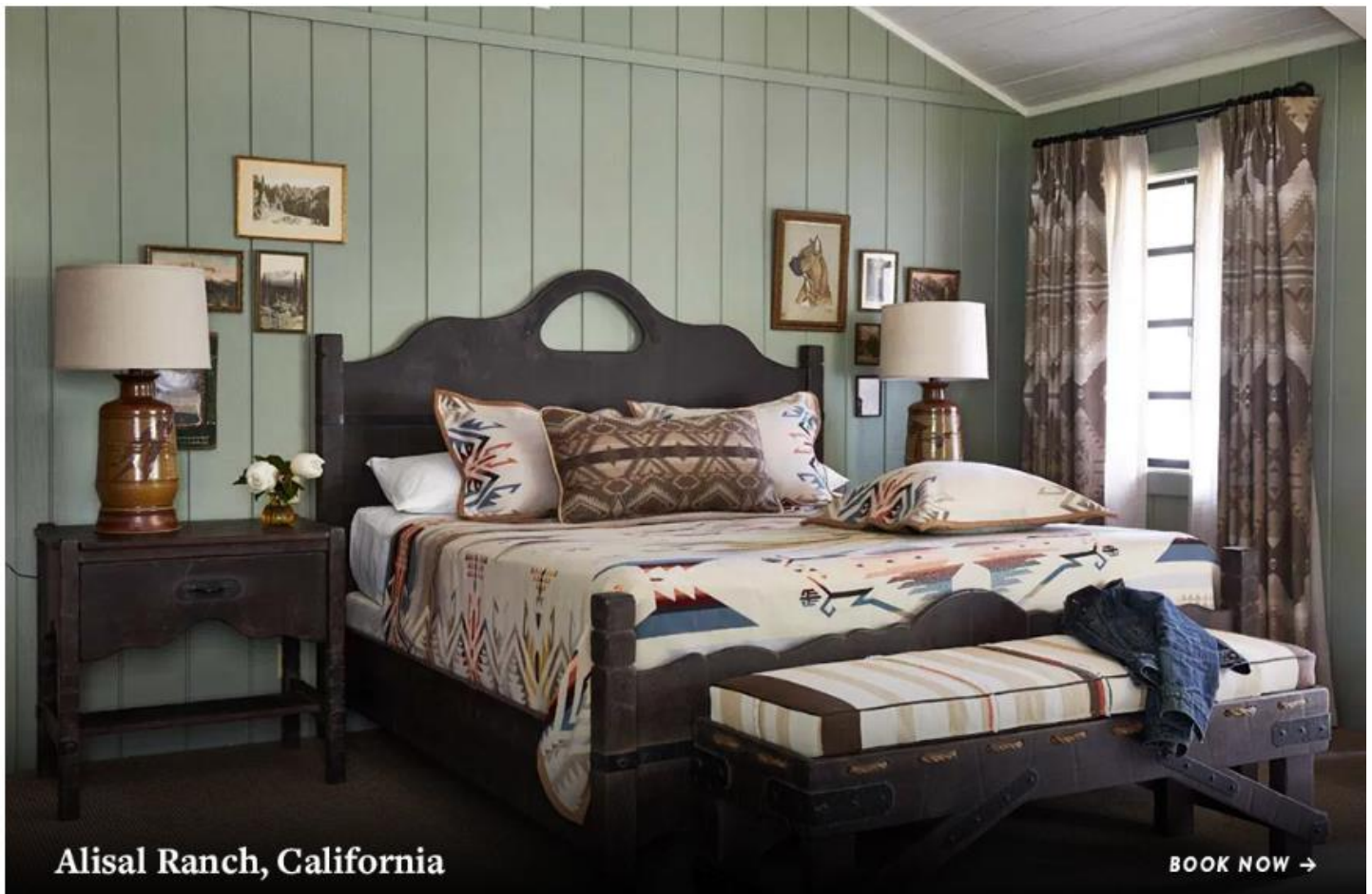
Alisal Ranch, California

Parents can be playing tennis or cycling—or relaxing at the spa—while the grandparents golf or go fishing with the kiddos. Santa Maria-inspired barbecue that is signature to the Santa Ynez Valley is the perfect food for everyone to come together over. Don't forget to pair it with incredible local wine.