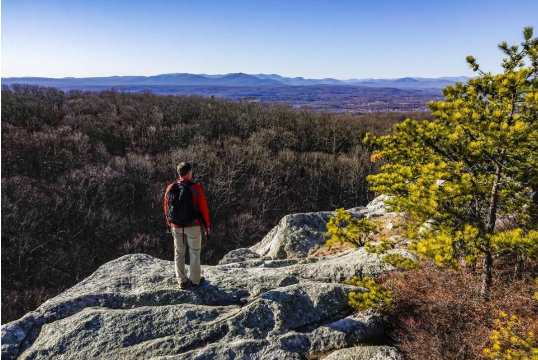
Activities include hiking and rock climbing. DARREN P. MCGEE

Imagine swimming in pristine glacial lakes, cycling on historic rail trails, riding horses near picturesque cliffs, kayaking through crystal clear waters or rock climbing on a White Quartz mountain range. There is no shortage of activities from which to choose, with the following being among the most popular for adrenaline-seeking visitors.