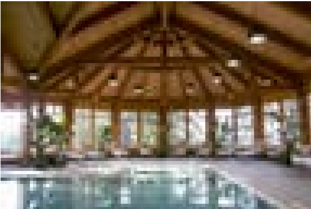
The Spa features an indoor heated swimming pool. MOHONK MOUNTAIN HOUSE

A little over an hour from the sky scrapers of New York City awaits a great day hike around Mohonk Mountain (Shawangunk). Sitting in the middle of a vast estate, the Mohonk Mountain House is surrounded by hiking trails. While there are many noteworthy trails on the estate, the Labyrinth trail is one of the most popular for good reason. It is packed full of climbing ladders and crevices that require some crawling. Additionally, there are resplendent views of the surrounding area, especially from the Skytop Tower which you can access via the Labyrinth trail.