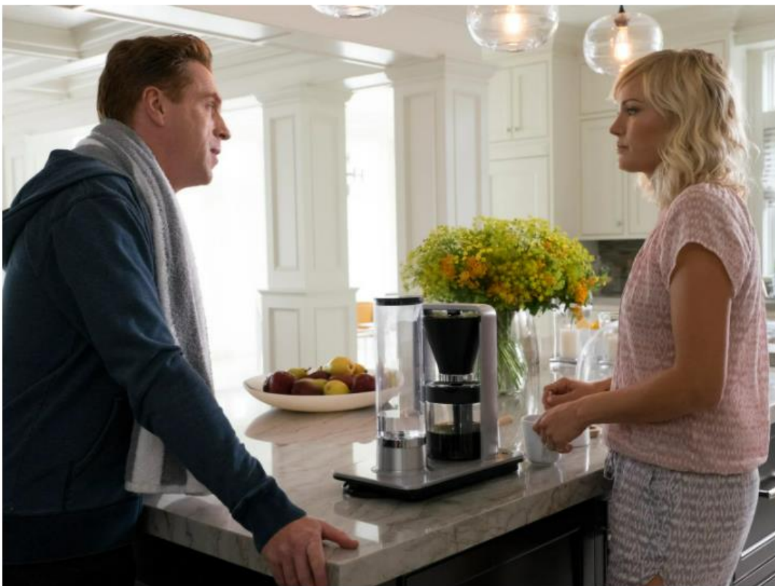
Bobby "Axe" Axelrod and Lara Axelrod's Hamptons home.