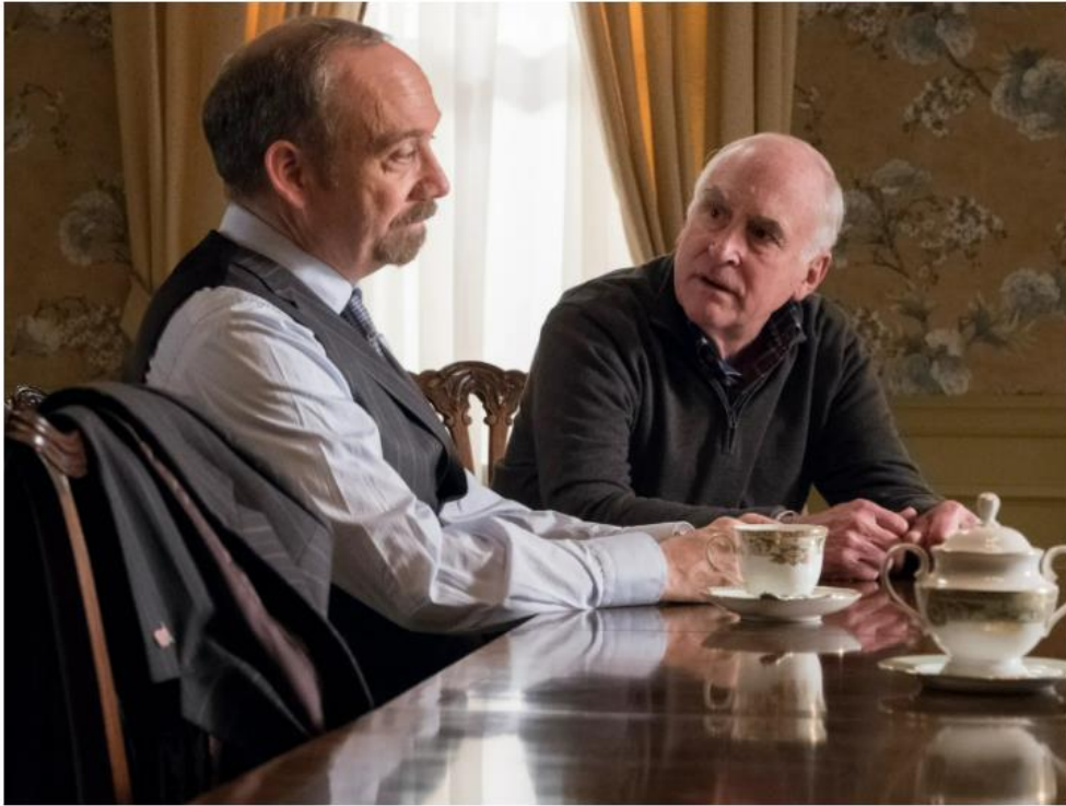
Chuck Rhoades, Sr.'s home.

In Billions , Chuck Rhoades Sr. is, of course, Attorney General Rhoades' father, as well as a successful businessman in his own right. Characterized as coming from a blue blood family, it's unsurprising that his Manhattan home is located on a prime corner of Fifth Avenue on the Upper East Side. The actual building that stands in for Rhoades Sr.'s is 1010 Fifth Avenue, a famed pre-war co-op located across the street from The Met. Currently, a five bedroom unit is for sale there for 11.7 million.