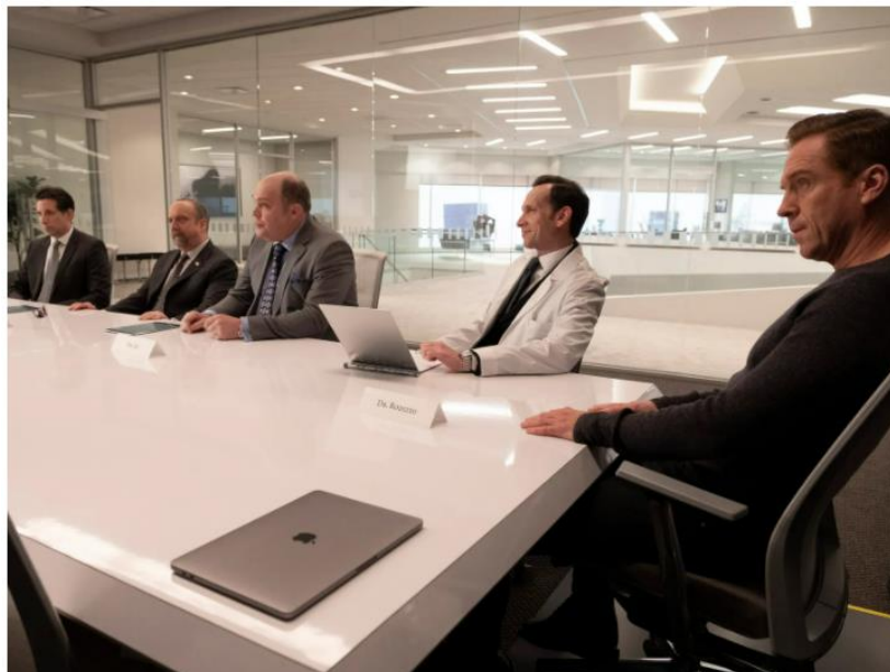
The Axe Capital office.

855 Sixth Avenue/ EOS Nomad , New York, New York