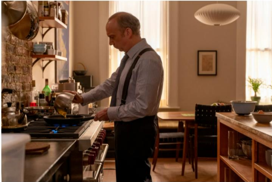
Chuck Rhoades's Brooklyn brownstone.