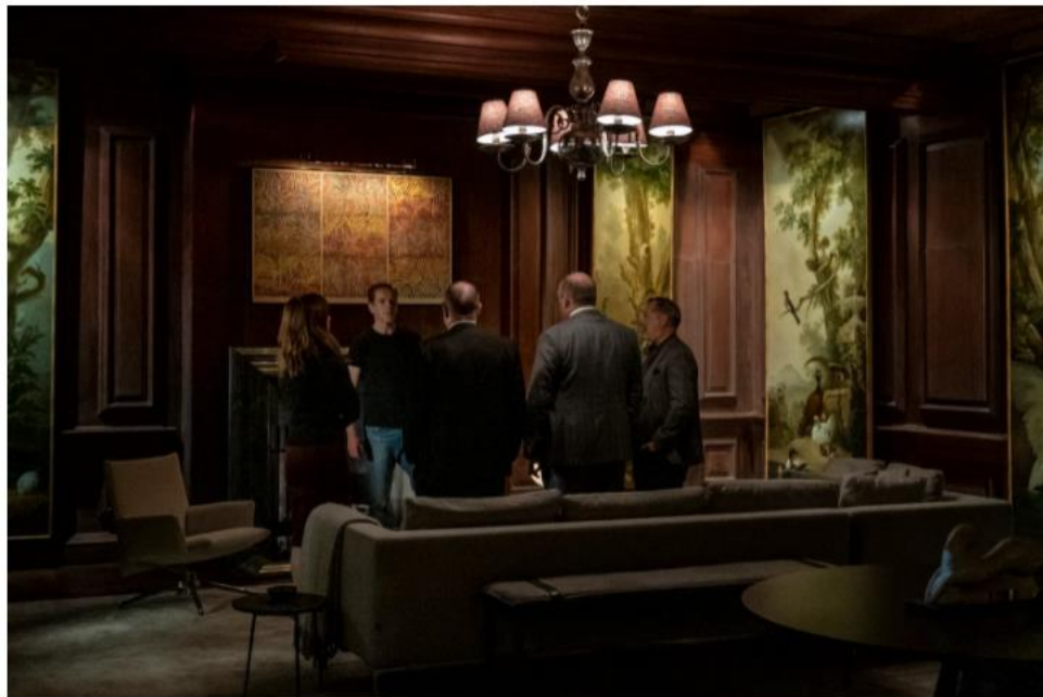
Bobby's country house.

Perhaps the filming location with the most history is Salutation , a private island off the coast of Long Island. Built by J.P. Morgan’s grandson Junius Spencer Morgan III in 1919, the ivy-covered, English-style mansion is an enormous 27,000 square feet and comes equipped with a 250-foot dock that’s large enough to accommodate seaplanes. Striking interior features include an 80-foot-long marble-tiled hallway, a mahogany-paneled library, and grounds designed by famed gardener Frederick Law Olmsted. It is also rumored that Jackie Kennedy spent time on the island in a guest house during the summer after JFK’s assassination. On Billions , Salutation ’s facade stands in for Bobby’s country estate; the house was also featured on an episode of Succession as the home of the Pierce Family. At its last listing in 2017, the island was valued at an impressive $125 million.