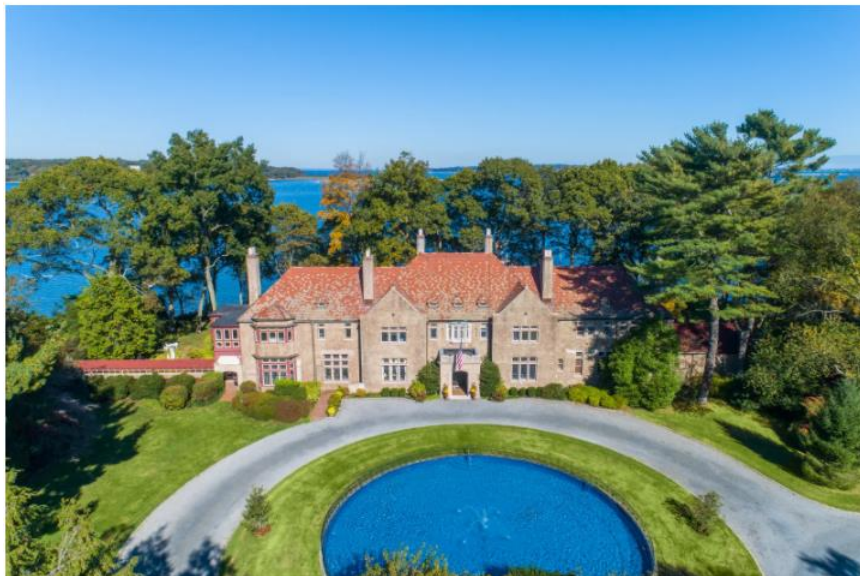
Panfield estate.

Panfield Estate in Lloyd Harbor, New York