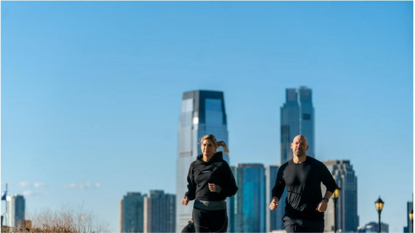
Gabrielle Reece as herself and Corey Stoll as Michael "Mike" Prince in a recent episode of Billions.