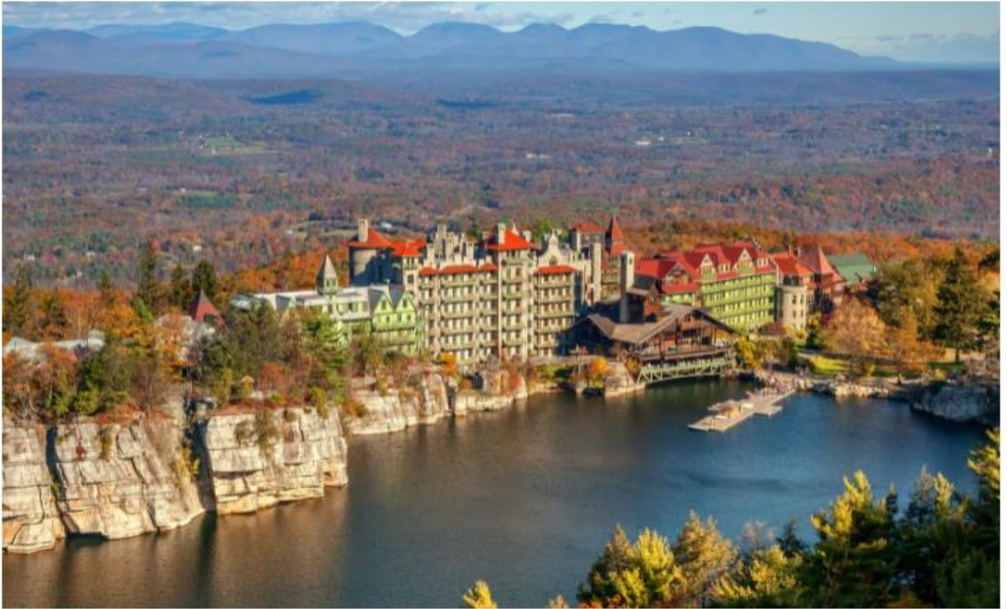
Mohonk Mountain House.

Eagle-eyed fans of historic hotels were able to spot this Hudson Valley resort during the episode when Bobby attends the Mike Conference. In real life, Mohonk Mountain House has played host to many of the country's political and social elite, including five US presidents and industrialists like Andrew Carnegie and John D. Rockefeller. The Victorian-style castle sits on 40,000 acres of lush forest, and provides guests with amenities like an ice skating pavilion, 85 miles of hiking trails, and a half-mile-long glacial lake.