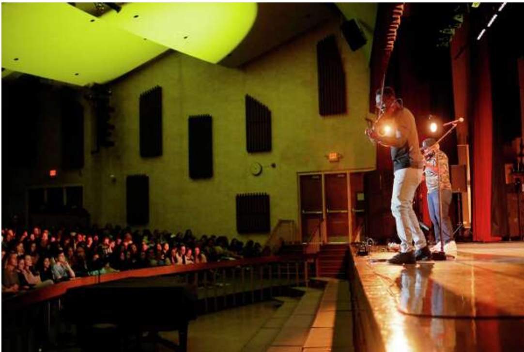
The best of the Capital Region