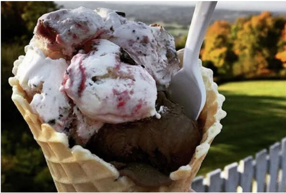
The ultimate guide to ice cream in the Hudson Valley